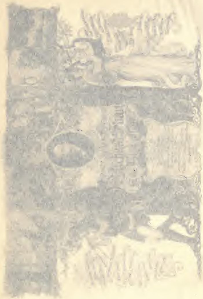
Menu of the dinner to Richard Strauss, 1904